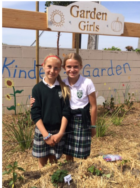
Image 2: Students at St. Patrick Catholic School in San Diego County smile in their garden that was supported by Literacy for Life grant funds.