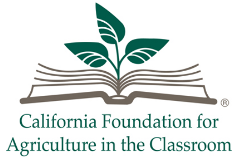
Image 1: The California Foundation for Agriculture in the Classroom logo.