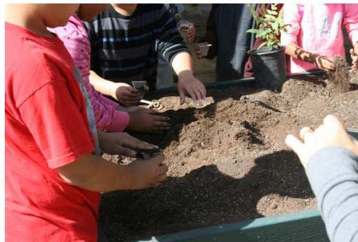
Photo of the Month: Students prep soil for seedlings at the California State Fair Farm during a field trip.