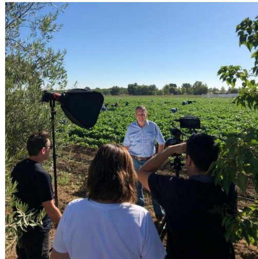
Behind the scenes at G&S Farms in Brentwood filming green beans for an upcoming project!