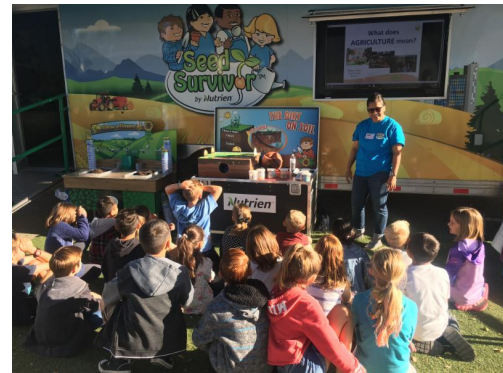
Third graders from San Diego County learning about agriculture and growing healthy plants!